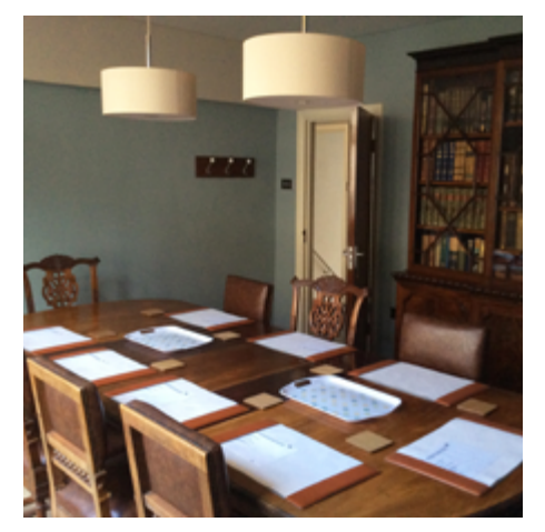
Tom Jones Committee Room

For details regarding the hire of rooms, please contact the Pantyfedwen Office on 01970 612806/ post@jamespantyfedwen.cymru